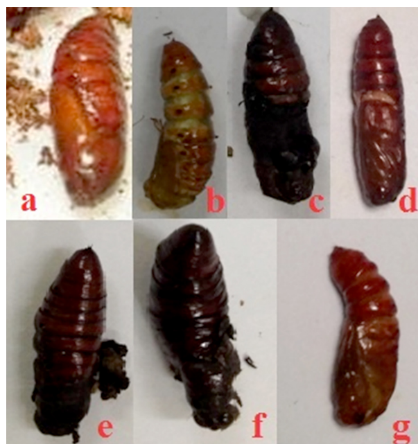
Figure 1. Normal (a) and abnormal pupae of Spodoptera litura that emerged from larvae treated with essential oils from Alpinia pyramidata (b), Lantana camara (c-d), Coleus amboinicus (e-f) and Curcuma longa (g).

Several plants showed growth inhibitory activities against S. litura . The development of the different intermediates between stages such as larval-pupal and pupal-adult, and the formation